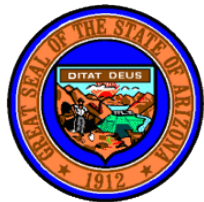
Governor Katie Hobbs

Or dial: (US) +1 475-343-3246 PIN: 378 946 835#